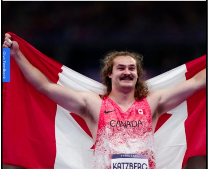
[1/4] Paris 2024 Olympics - Athletics - Men's Hammer Throw Final - Stade de France, Saint-Denis, France - August 04, 2024. Gold medalist Ethan Katzberg of Canada celebrates after the final. REUTERS/Gonzalo Fuentes Purchase Licensing Rights