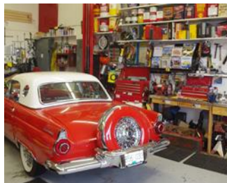
Del's 56 T-Bird...