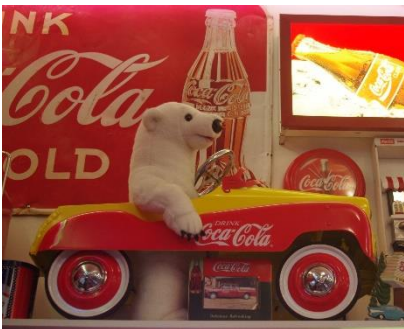
One of the many pedal cars