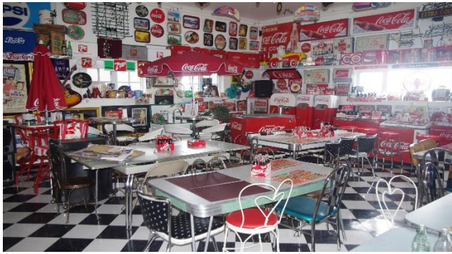
Del's deli restaurant

As I have said before I believe that our club travels on it's stomach as we always seem to include food in our events,