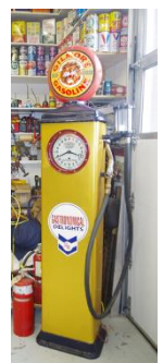
& gas pump

It was great day and many thanks to those that opened up their garages for us to visit and the members that came for the tour and fun.