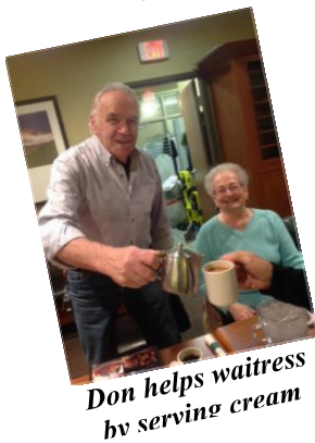
Don helps waitress by serving cream