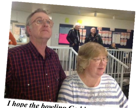
I hope the bowling God is watching!