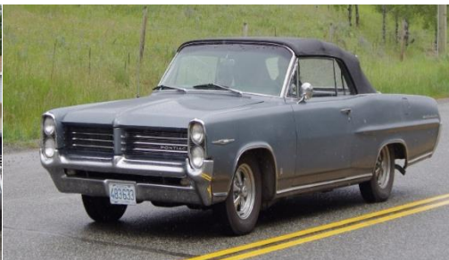
Gieselman's '64 Pontiac