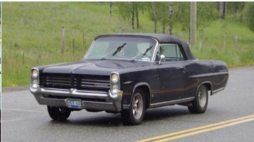
Obeiglo's '64 Pontiac