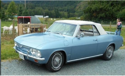
Bell's '66 Corvair