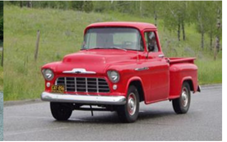
Arcand's '66 Chevy