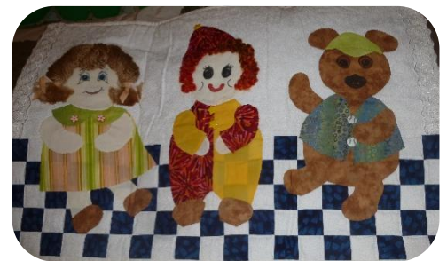
Do you see any resemblance in the two pictures?

Most of the group went to a local pub for dinner but a few of us went to the copper room and enjoyed the live music and the dancing. Ken and Marge gave us a short demo but the rest of us were happy to watch.