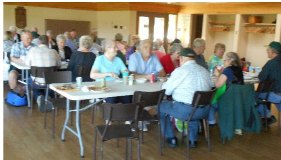
Crowd enjoying their supper