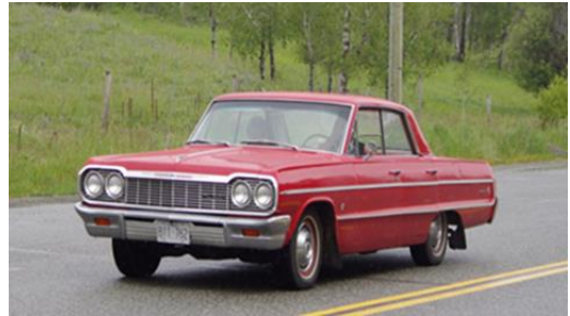
Foley's '64 Chev