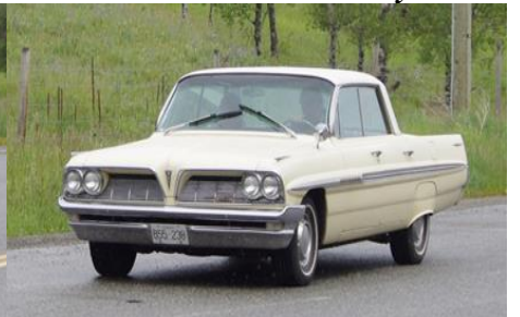
Hoshowski's '61 Pontiac