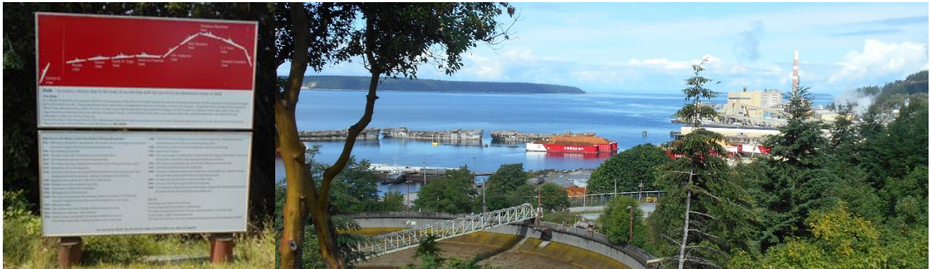
How they made a floating break water using old merchant and war ships