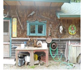
{Coffee roaster along with some antiques}