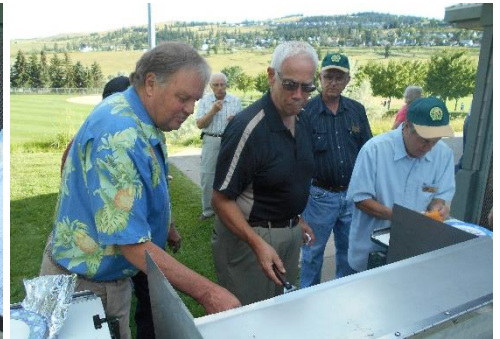
Two serious looking cooks!