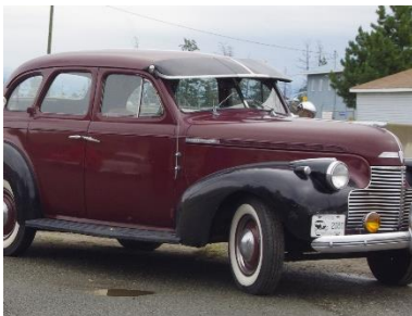
Surline's '40 Chev