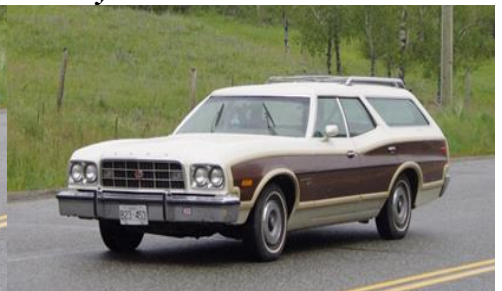
Carroll's 73 Ford