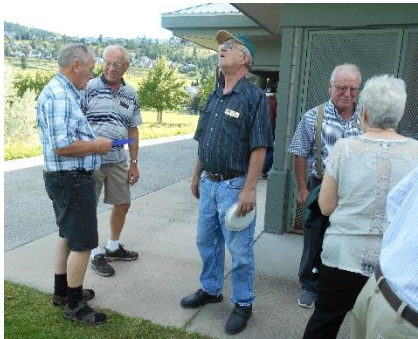
Is that a bird I see?