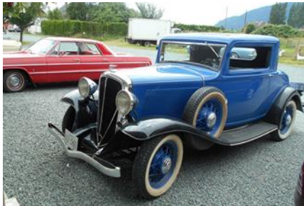
Bawtree's '32 Rockne