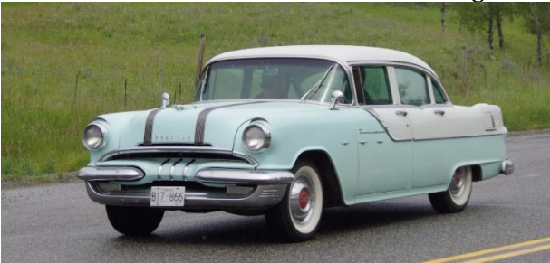
Chamber's '55 Pontiac