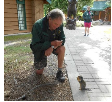
Dick did not seem to have as many friends as Niki

The next morning we continued in rainy conditions through more beautiful country to the Othello Tunnels in Hope. Although the rain was steady, people were dressed for the weather and explored the spectacular tunnels and canyon.