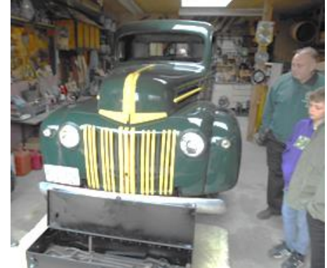
Following the tour some of the gang stopped at the Westsyder Pub for lunch. Another great day. Thanks Terry. 😊