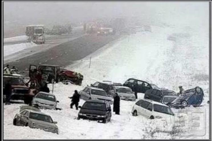
The annual meeting of the Summer Tires Club.

This years meeting Was held Between Chilliwack & Abbotsford Thursday December 8 th More than expected attended