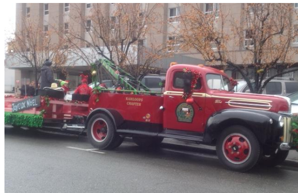
Lining up by the Double Tree Hotel