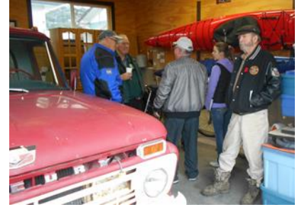
As the day was dry some of the members drove their Vintage for the tour.