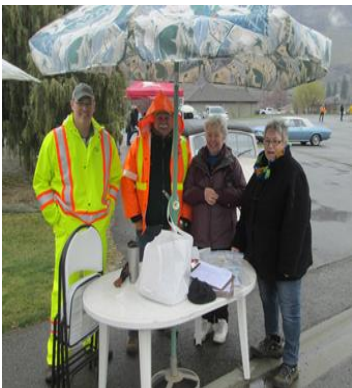
Vehicle Check In