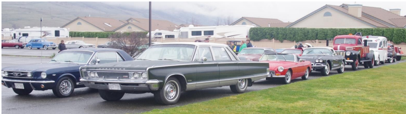
Nice line up of cars considering the weather