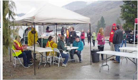
As you can tell by the dress the weather is not the best