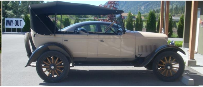
Engel Bouwmeester's 1924 Studebaker