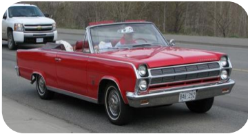
1965 Rambler Ambassador Convertible 990 $26,000 Completely