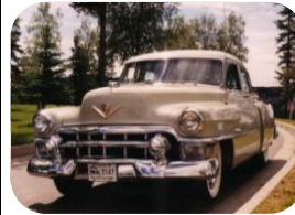
1953 Cadillac $15,900 4dr sedan Total Ground Up restoration V-8 Hydramatic, PS, PB. New radial tires &