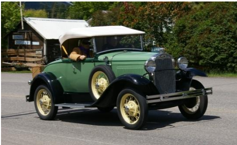
Charlotte Jurreit's 1930 Model A