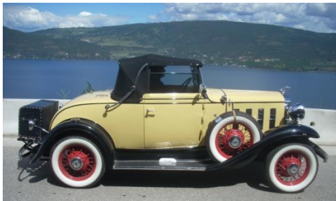
Glenn Gallagher's 1932 Chev