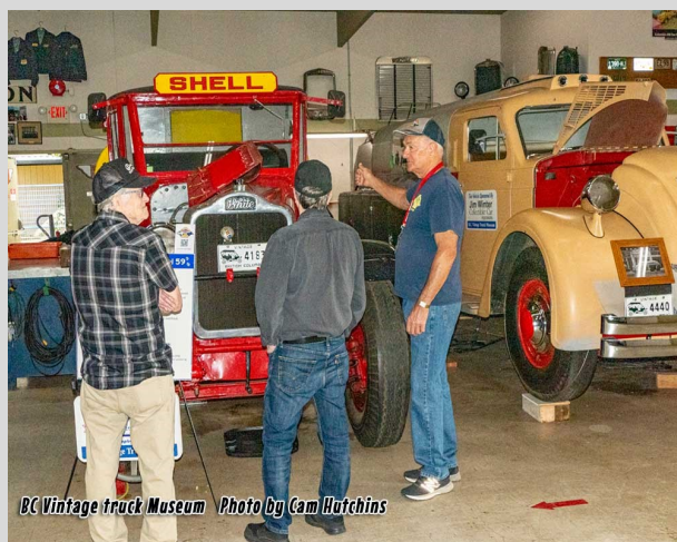
BC Vintage truck Museum

One never knows what councils may decide to do with their buildings.