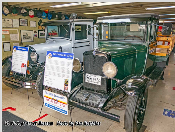
BC Vintage truck Museum