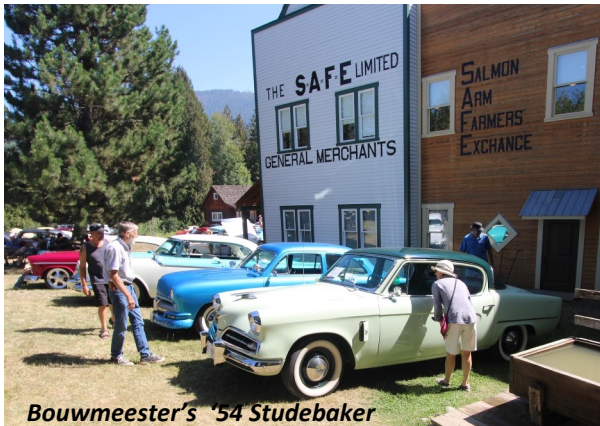
Bouwmeester's '54 Studebaker