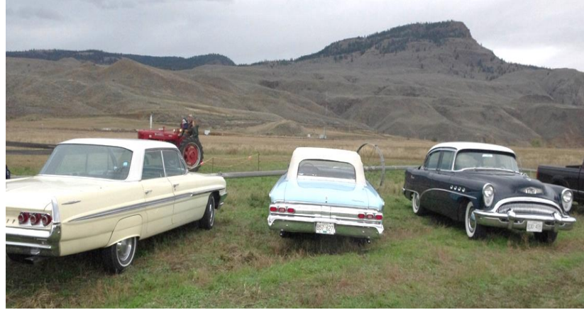
Members vehicles that made it out for the show.