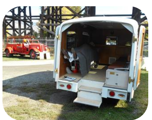
Club Ambulance was once again apprecaited by the visitors. Lot's of questions were asked about it's service to Kamloops.