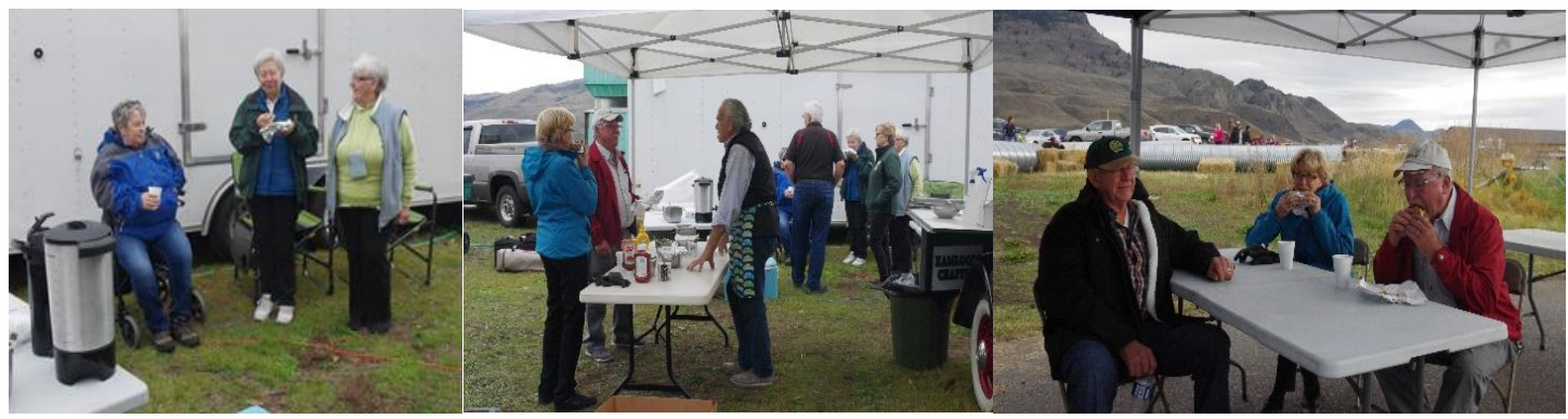
Club Members enjoy the socilaizing and dining